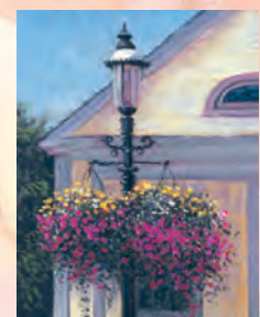
Street Light Garden by Helena Van Emmerik-Finn